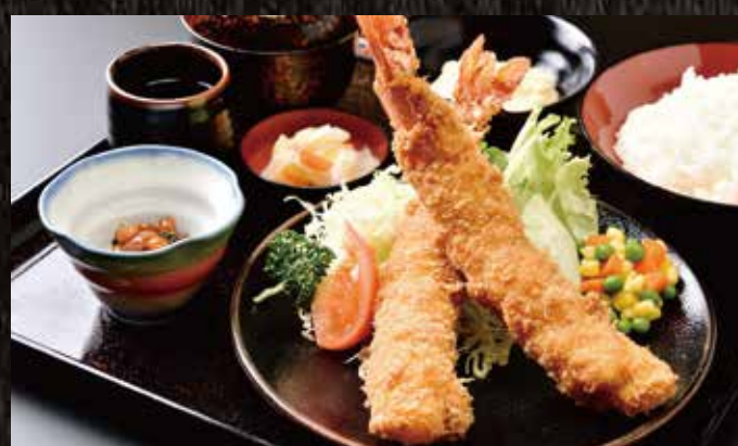
Shrimp fry set meal