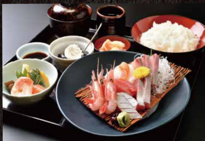
Sashimi set meal