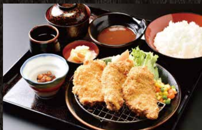
Fillet cutlet set meal